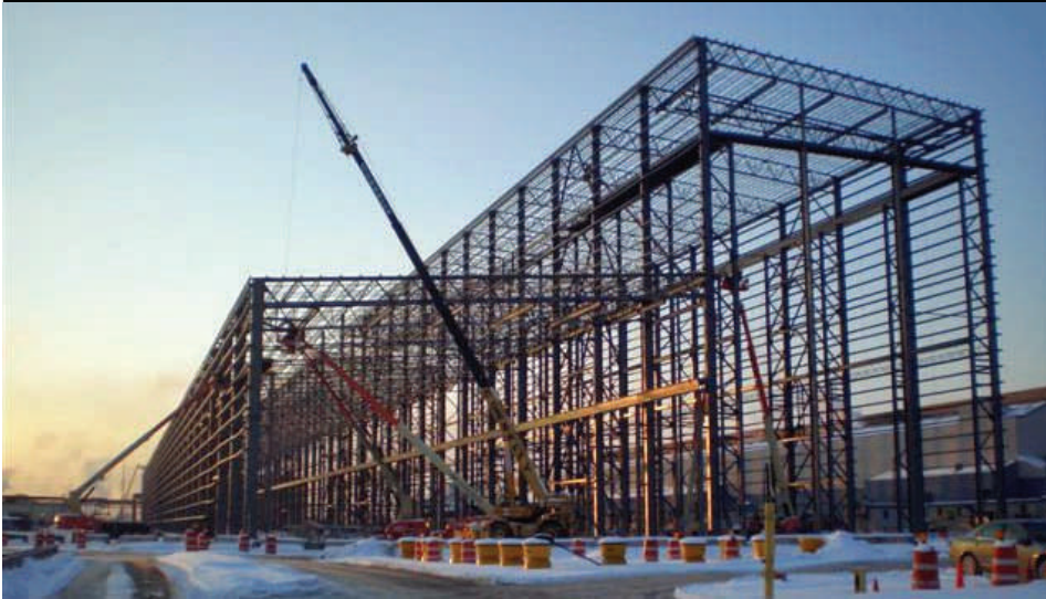
SeverStal Hot Dip Coating Line Dearborn, Michigan