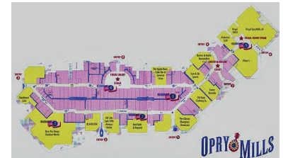
Retail & Entertainment Mall

This approximately 1.5 million square foot project combines retail, entertainment, and dining venues into a unique experience for the entire family. The project includes a 20-plex Regal Cinema, an IMAX theatre, a large food court, and notable anchor tenants such as Bass Pro Shops, Bed Bath & Beyond, Dave & Buster's, Rainforest Café, Borders, Old Navy and Gibson Guitar Showcase. The entire Mall is serviced by an underground tunnel providing access to the "back-of-house" area of all tenants on the interior of the Mall. The grand opening was in the Spring of 2000.