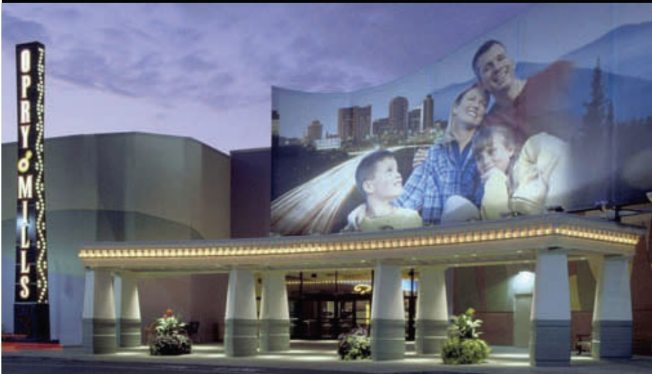
Opry Mills Mall Nashville, Tennessee