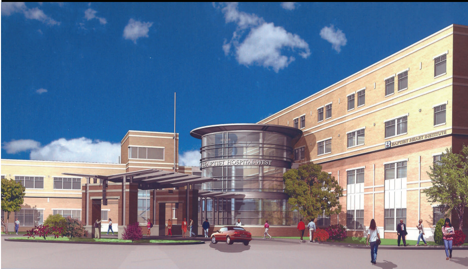
Baptist Hospital West Knoxville, Tennessee